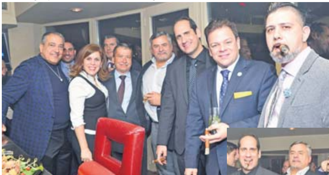
Some of the members of the Hellenic Board of Trade of Metropolitan Montreal who enjoyed themselves at the HBOT's cigar tasting event on Jan. 25.