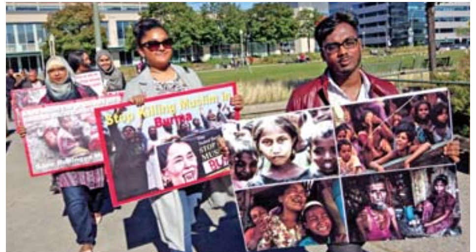
Pro-Rohingya protesters arrive at Park Extension's Place de la Gare on Oct. 1 for a demonstration drawing attention to the atrocities taking place in Myanmar.

Reminded that he was making his comments in Park Extension, which is regarded as one of the most active gateways for immigration in