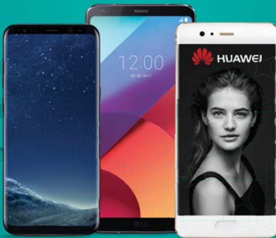
SAMSUNG Galaxy S8