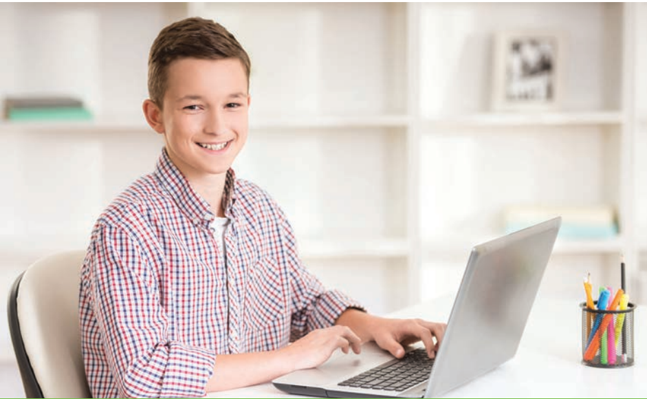
Make sure your teenagers have a quiet study area and help them organize their study routine.

Just because your children are teenagers, it doesn't mean they no longer need help with their homework. On the contrary, as a parent, your role is to develop strategies that encourage your children and support them in taking charge of their schoolwork.