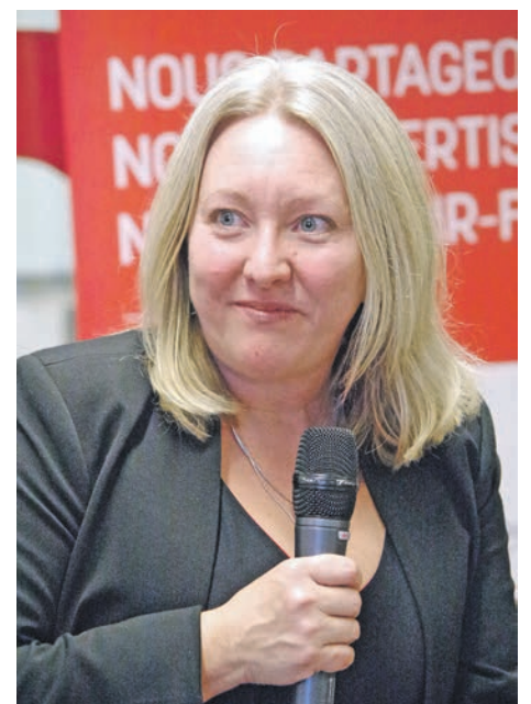
Federal Minister for Middle Class Prosperity Mona Fortier made her first road-trip stop in Montreal last week during a pre-budget consultation.

"We need to find those programs and measures to bring them to be able to join the middle-class. And for me that's what's important. We want all Canadians to succeed and to prosper. And that's my objective: to find ways to make sure that we do that."